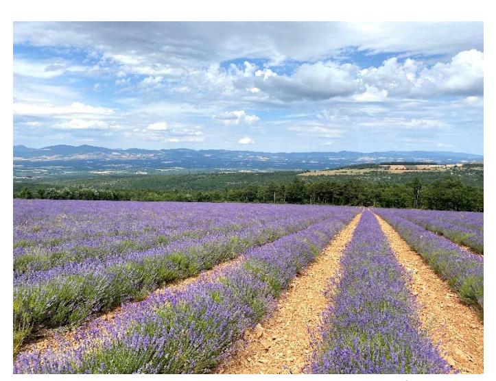
Botanical: Lavandula Angustifolia