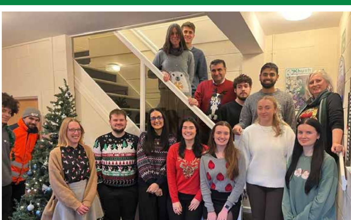
The UK Khush Team on Christmas Jumper Day, supporting Save the Children.

Thank you for your continued support throughout 2023 and we look forward to working with you all in 2024.